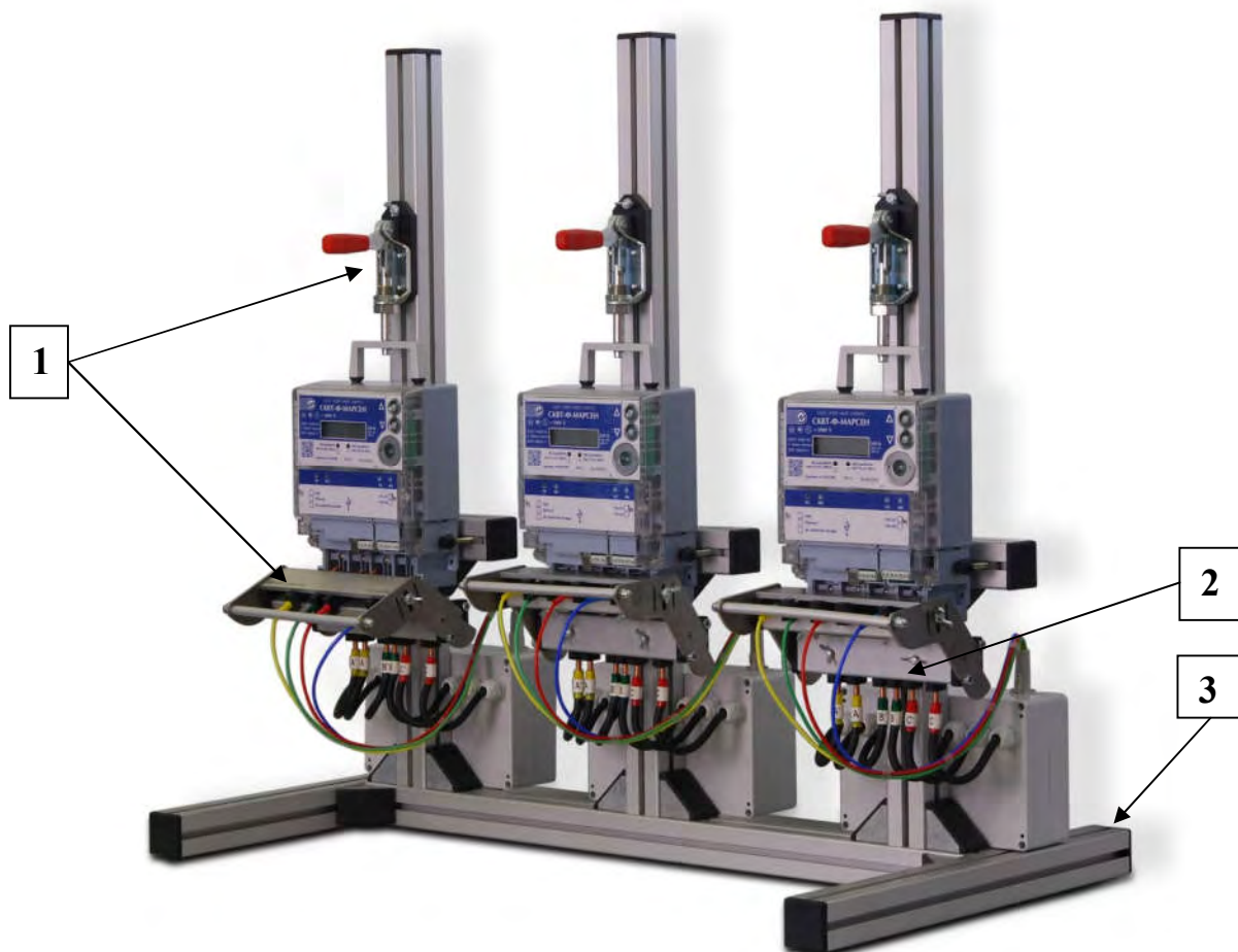
Fig.1 Test bench SMD3-3

The Contact panel for voltage and current connections to the test system is located on the rear side of the Test bench (see Fig. 3). There are 4 voltage connectors and 6 (3 input and 3 output) current connectors.