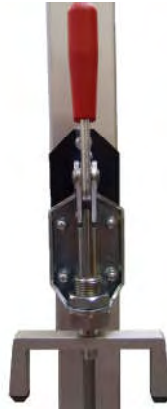
Fig. 4 Holder for fixing the meter in vertical plane